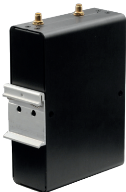
DIN-Rail Mount Illustration