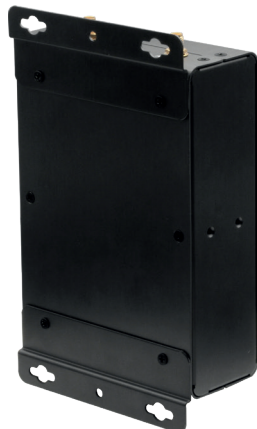
Wall Mount Illustration