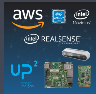
UP Squared RoboMaker Developer Kit