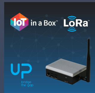
IoT in a box: LoRa easy deployment