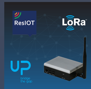
ResIoT: On-premises private network solution