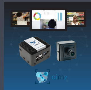
UP Squared AI Edge Retail Suite by AIM2