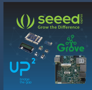
UP Squared Grove IoT Development kit