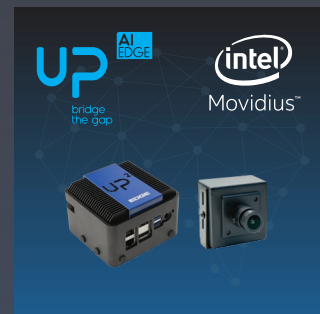
UP Squared AI Vision X Developer Kit