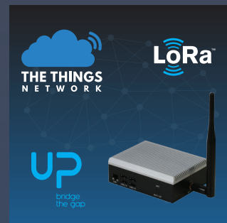
UP LoRa® Computing + The Things Network starter kit