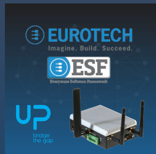
Eurotech ESF starter kit