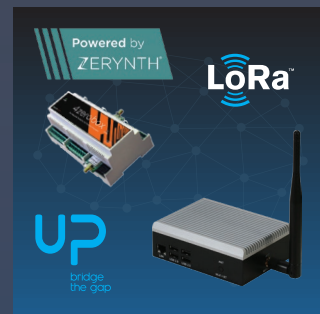
LoRa + 4ZeroBox Industry 4.0 over LoRa on the edge