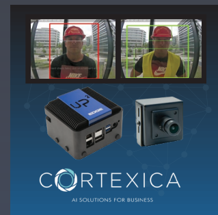
UP Squared PPE monitoring by Cortexica